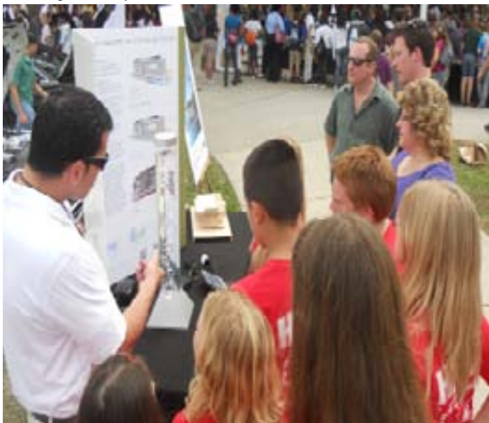
Visitation was estimated at 10,000 over two days.

For additional information, visit the official Solar Decathlon home page: http://www.solardecathlon.gov/ .