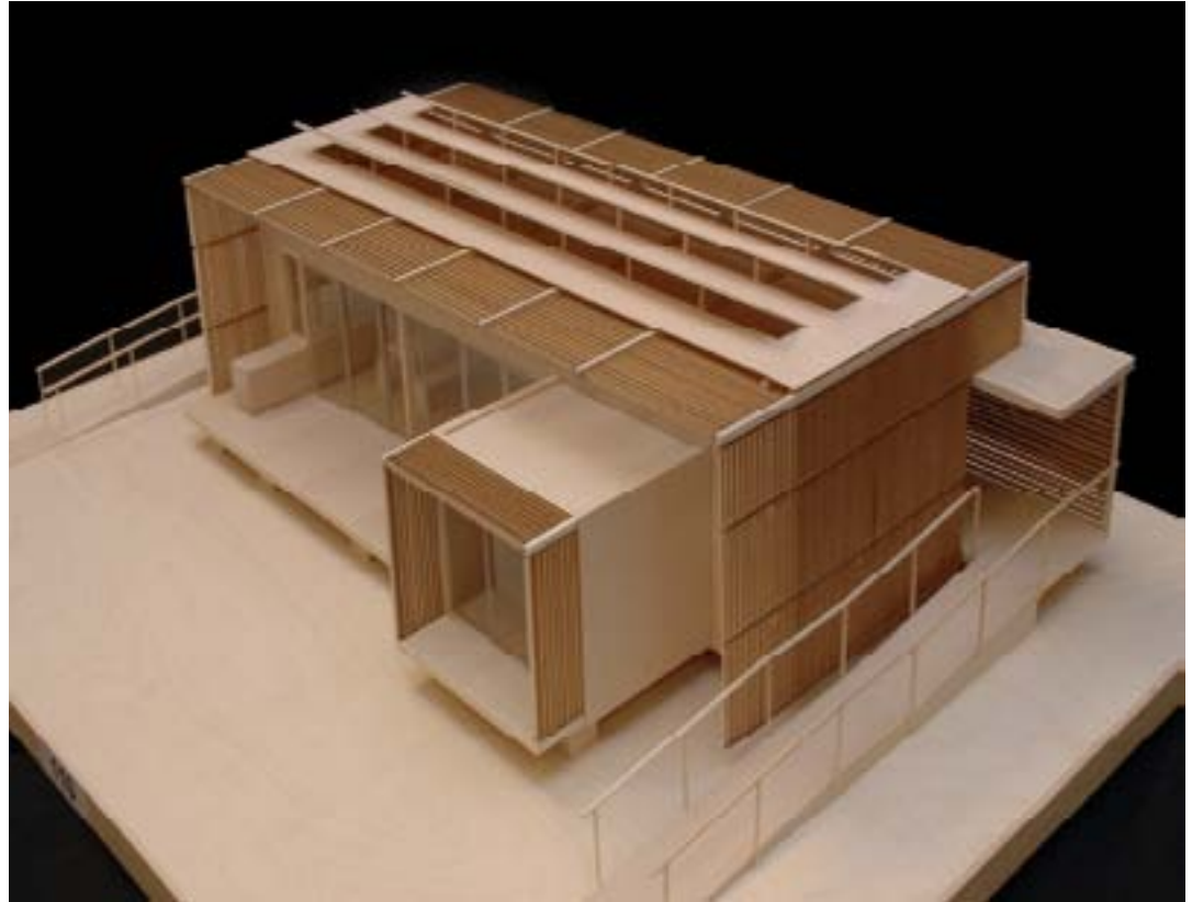
FLeX House, which stands for Florida Zero Energy Prototype, is Team Florida's entry in the U.S. Department of Energy Solar Decathlon 2011.

Alderman believes the revolution of the construction industry is unavoidable